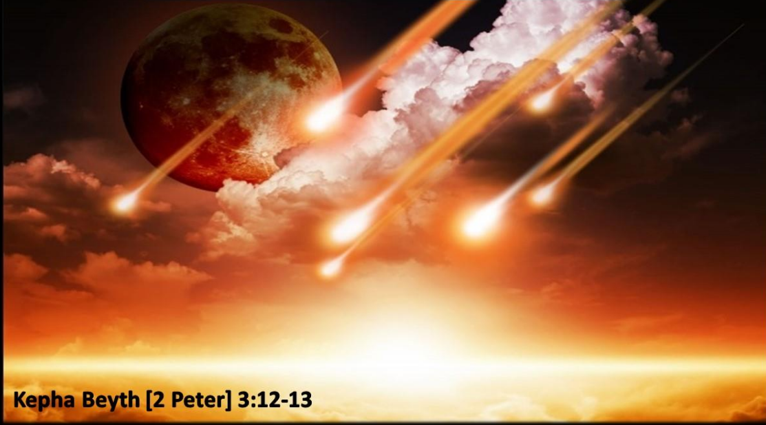
Kepha Beyth [2 Peter] 3:12-13

Kepha Beyth [2 Peter] 3:12-13 Looking for and hasting unto the coming of the day of Yahweh, wherein the heavens being on fire shall be dissolved, and the elements shall melt with fervent heat? 13 Nevertheless we, according to his promise, look for new heavens and a new earth, wherein dwelleth righteousness.