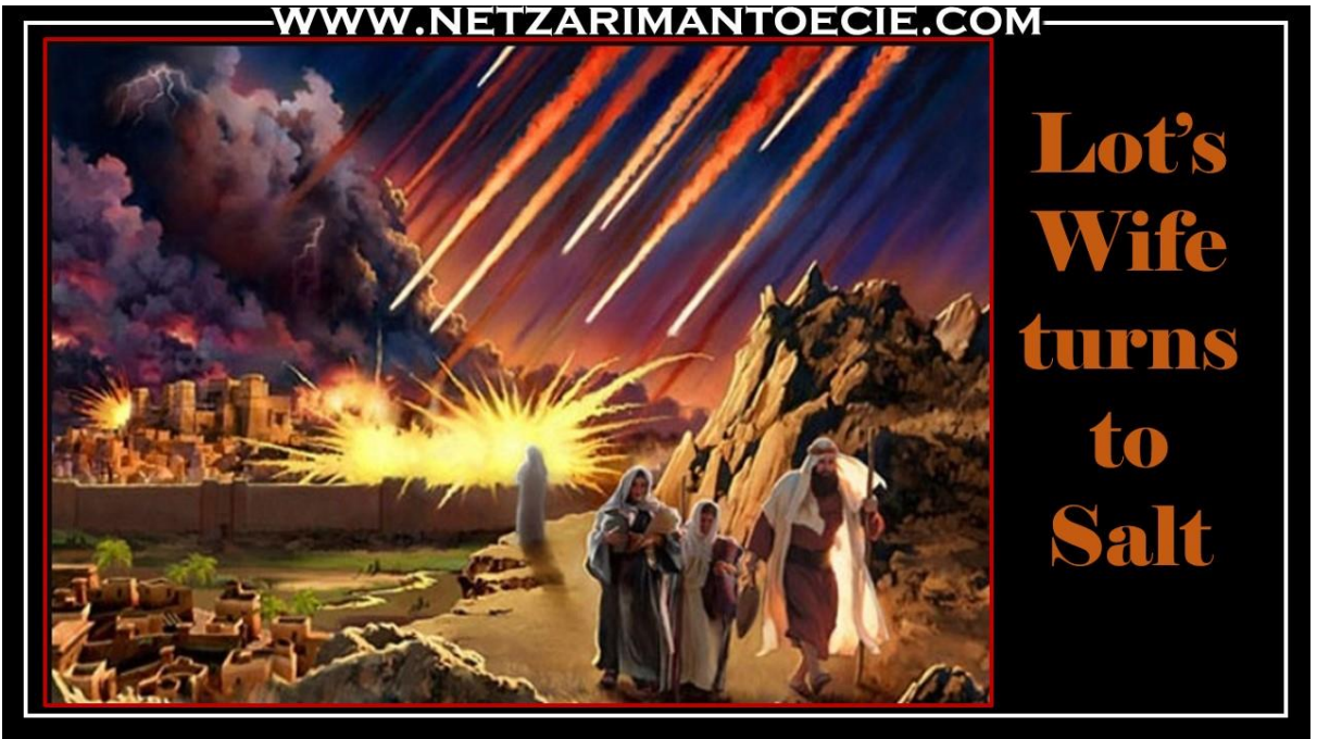
lot's wife looks back turning to a pillar of salt because she looks back.