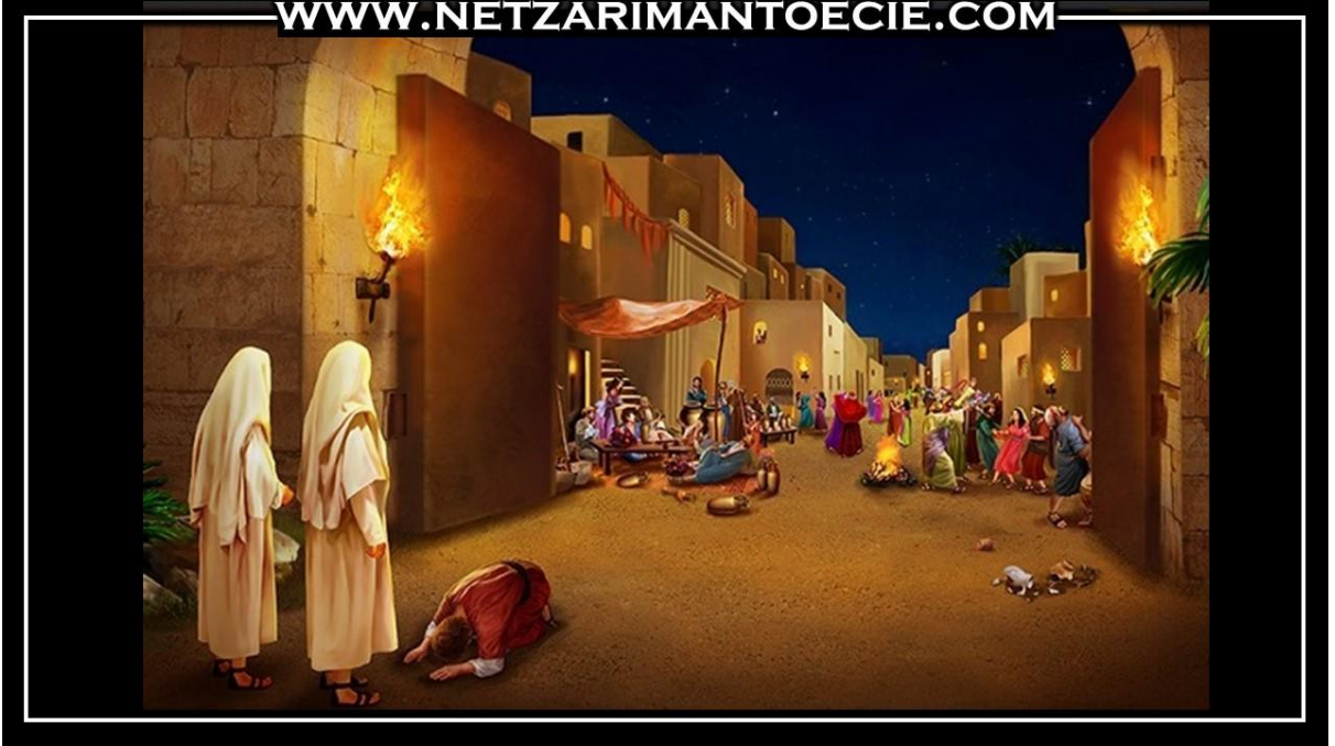
The Malakim rescue Lot from Sodom & destruction comes.